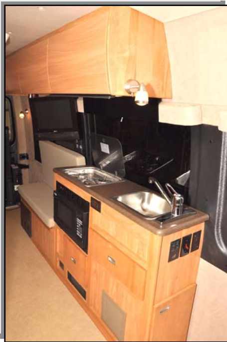
Galley with portable refrigerator