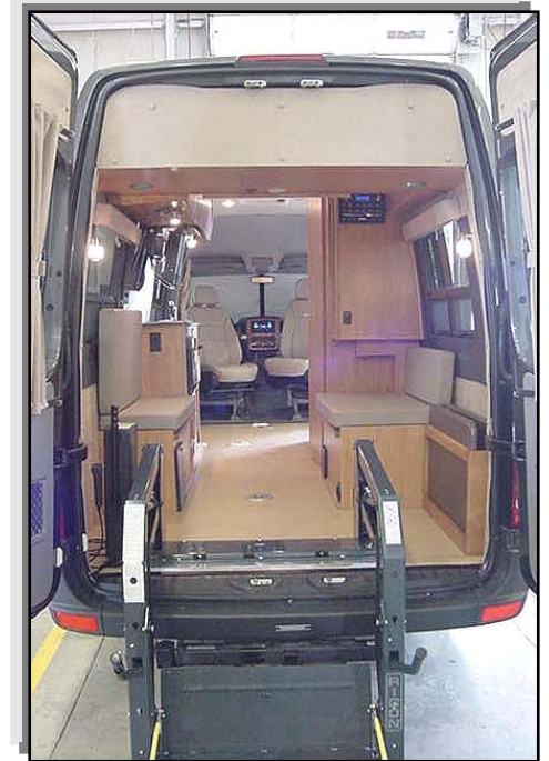
Rear platform lift access