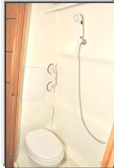
Convenience of a bathroom