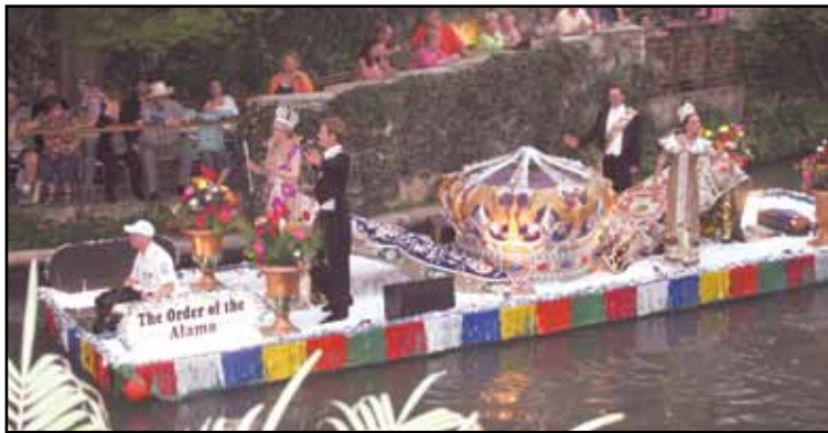
Alamo Queen float